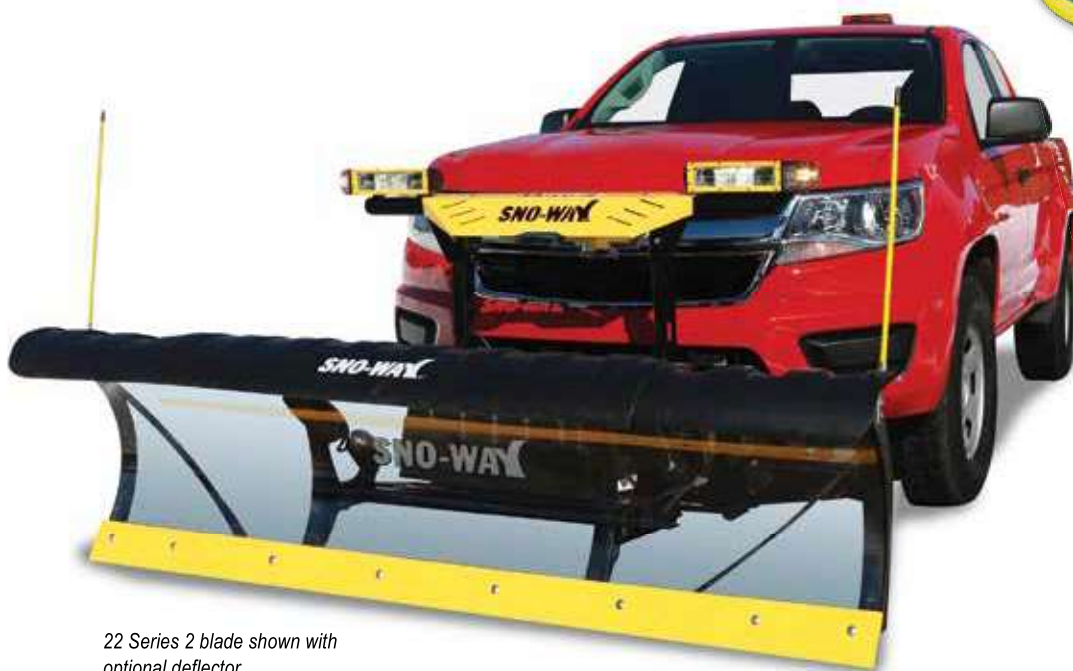
22 Series 2 blade shown with optional deflector

** Optional Auxiliary Light not for highway use