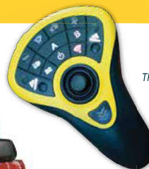
The wired or wireless Pro Control 2 Plus allows for easy one-touch button control.